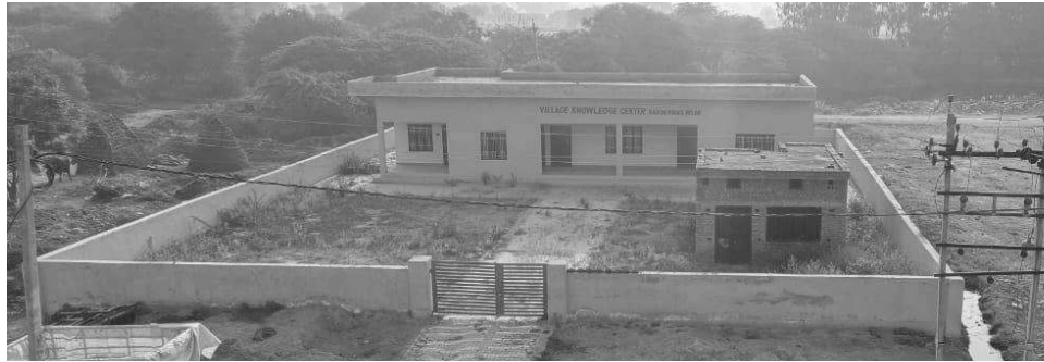
Photograph of Building