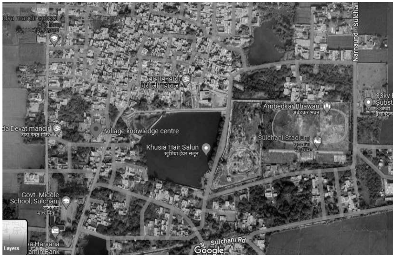
Google Map location showing Site at Rakhigarhi, Haryana “Village Knowledge Centre” Geo-Coordinates: 29.21121494437659, 76.17898019817032